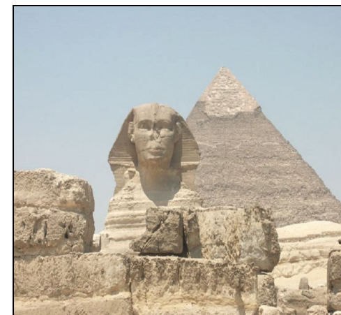
Pyramid and Sphinx at Giza