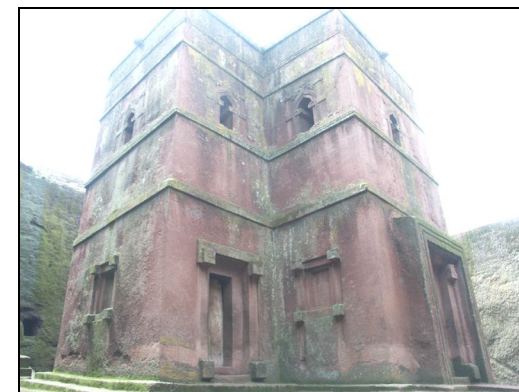
St. Georges Church, Lalibela

December 28, 2011 to January 7, 2012 (11 days)