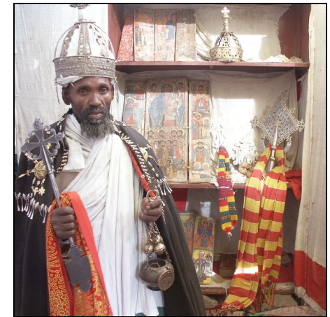
Monastery Priest, Lalibela