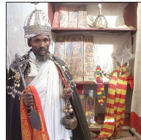
Monastery Priest, Lalibela